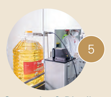
Customize & Distribute

Relying on our market knowledge to ensure responsive supply across platforms and regions.