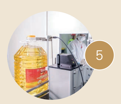
Customize & Distribute

Relying on our market knowledge to ensure responsive supply across platforms and regions.